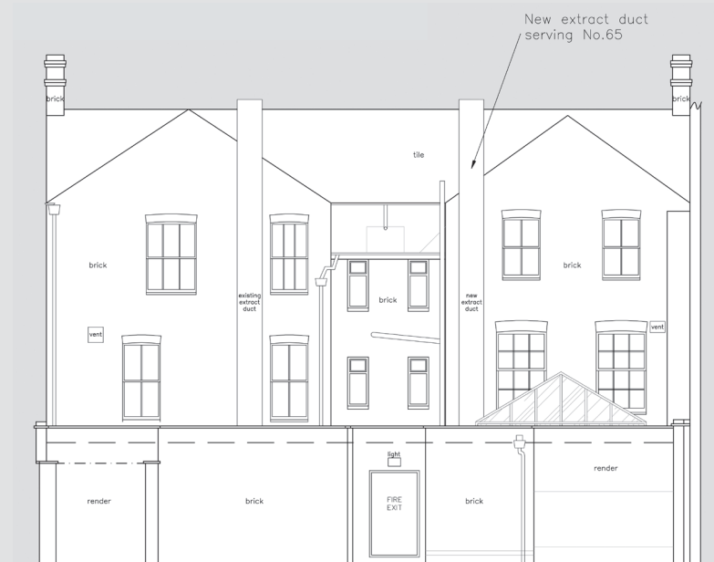
Planning Permission 201390 - Permitted Rear Elevation